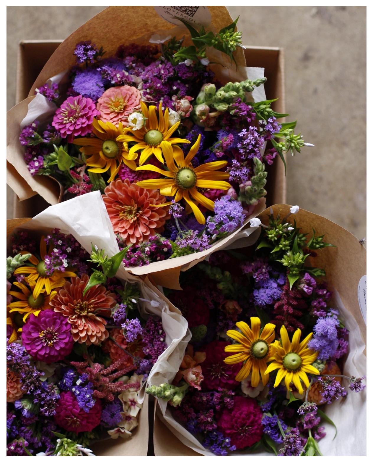
Pictured are bouquets produced from the 2022 season when Clovergold Flower Farm received 4" of rain for the entire growing season.